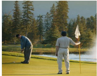
Prevent golf course trees from overgrowing