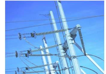
Good alternative for ROW maintenance