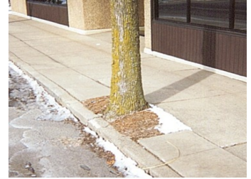
Aids in drought conditions & girdling roots