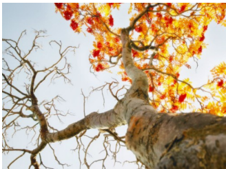
Helps declining Oaks, and other large trees