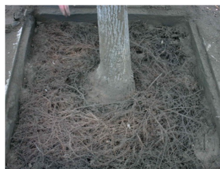
Enhance fine root hair growth in trees