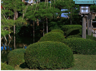
Control the growth of woody shrubs