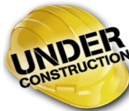
Treat trees before construction damage