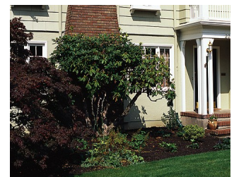
Slows the growth of crowded landscapes