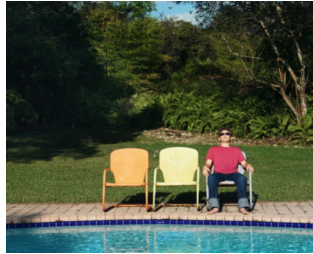
Control trees that may shade pools & decks