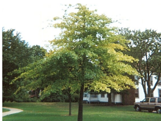
Reduces chlorosis in many trees